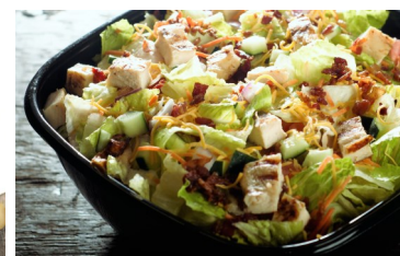
Chicken Chopped Salad Bowl