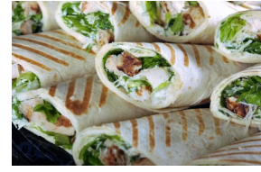
Chicken Caesar Wrap Tray