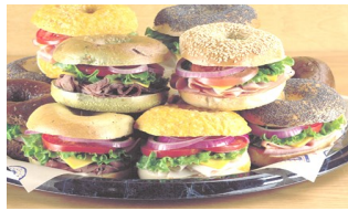
Deli Sandwich Tray