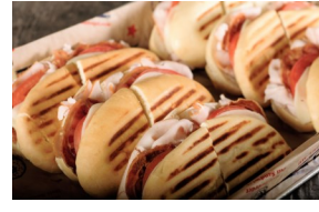
Turkey Club Panini Tray