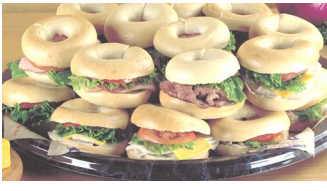
Mini Sandwich Tray