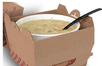
Soup or Chili 1 Gallon

SOUP VARIETIES Chicken with Wild Rice, Broccoli Cheddar, Chicken Noodle, Vegetable, Beef Barley, Chicken Dumpling, Potato Cream Cheese, Chicken Tortilla, Minestrone, Garden Vegetable, Tomato Tortilla, Italian Wedding, Greek Lemon Chicken, Lobster Bisque and more