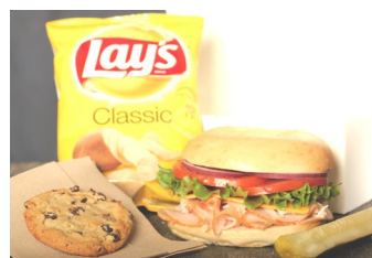
All American Box Lunch