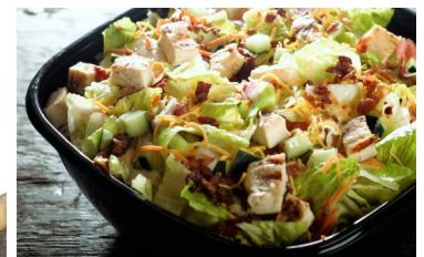
Chicken Chopped Salad Bowl