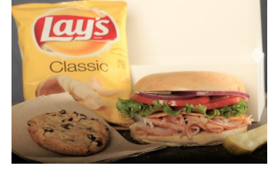
Turkey Box Lunch