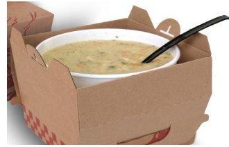
Soup or Chili 1 Gallon

SOUP VARIETIES Chicken with Wild Rice, Broccoli Cheddar, Chicken Noodle, Vegetable, Beef Barley, Chicken Dumpling, Potato Cream Cheese, Chicken Tortilla, Minestrone, Garden Vegetable, Tomato Tortilla, Italian Wedding, Greek Lemon Chicken, Lobster Bisque and more