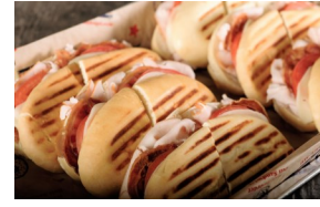
Turkey Club Panini Tray