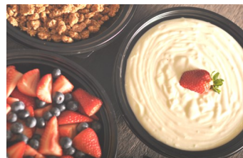
Yogurt Parfait- Build your Own