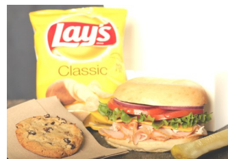
All American Box Lunch