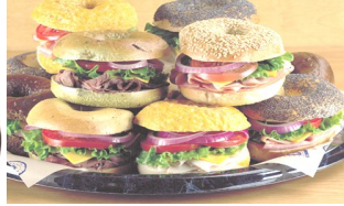
Deli Sandwich Tray