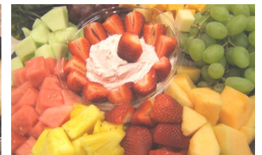
Fresh Fruit & Cheese Tray

Prices subject to change Revised on 08-15-2024