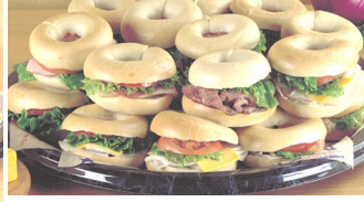
Mini Sandwich Tray